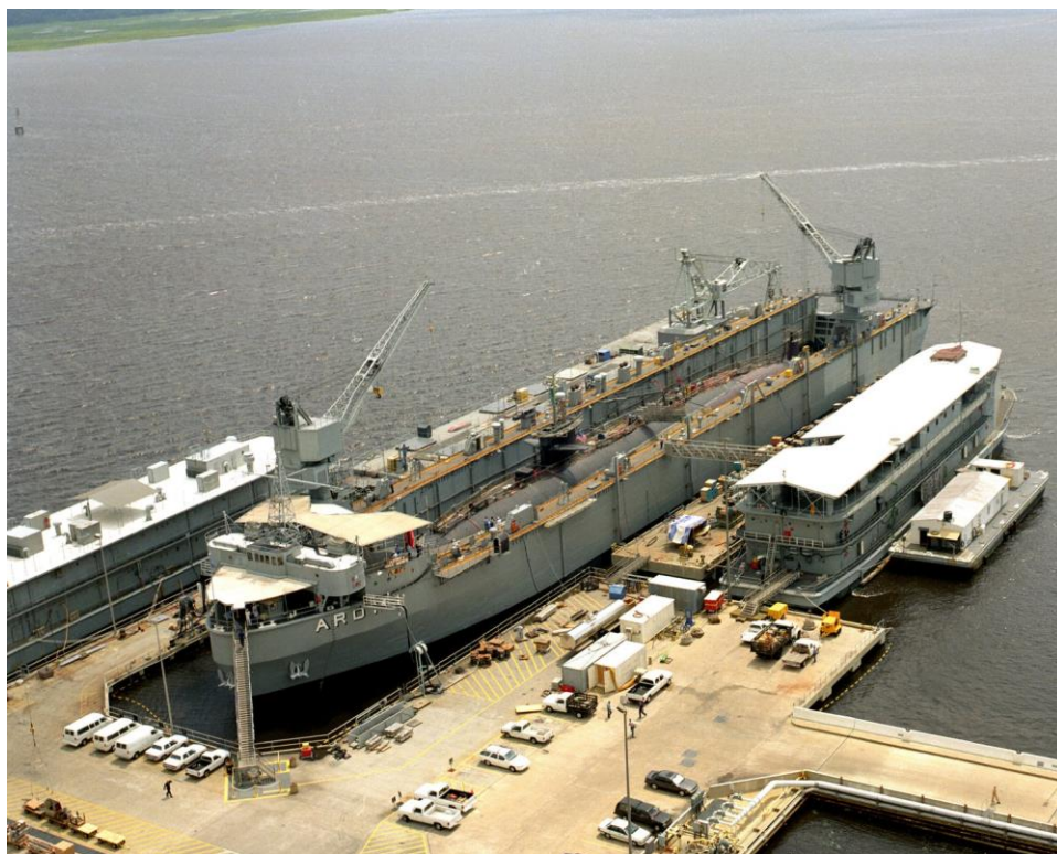
The USS Oak Ridge with a Los Angeles Class nuclear attack submarine in her dock

(As published in The Oak Ridger's Historically Speaking column on June 1, 2017)