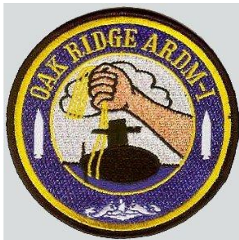
The USS Oak Ridge patch

Stop by, see the artifacts, talk to the crew, and let them know how their service to our country is appreciated.